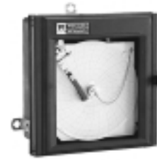
6" CHART SIZE ONE PEN RECORDER

Combination Temperature – Pressure Recorders Available.