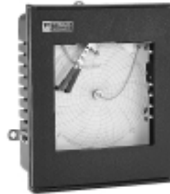
8" CHART SIZE ONE PEN RECORDER