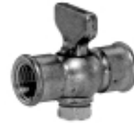
TEE HANDLE COCK (A10)