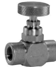
BAR STOCK NEEDLE VALVE (Brass) (BBV4)