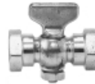
HEAVY DUTY TEE HANDLE (A10E)