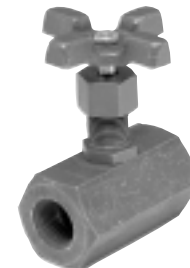
BAR STOCK NEEDLE VALVE (AV34)