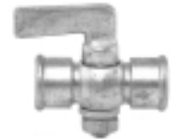
LEVER HANDLE COCK (A12)